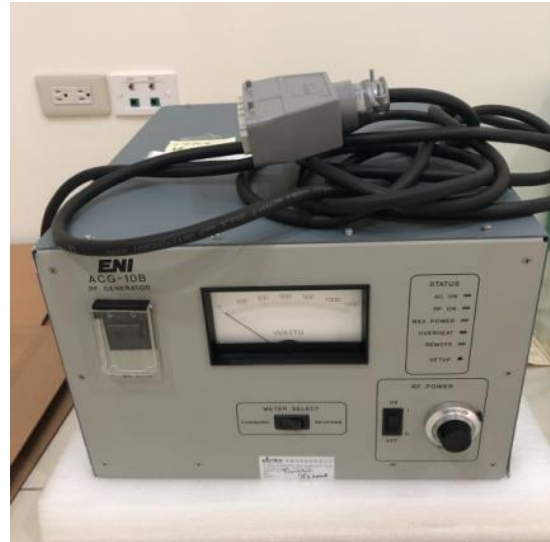
ENI ACG-10B RF GENERATOR*1