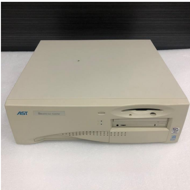
AST BRAVO LC 5200M*1